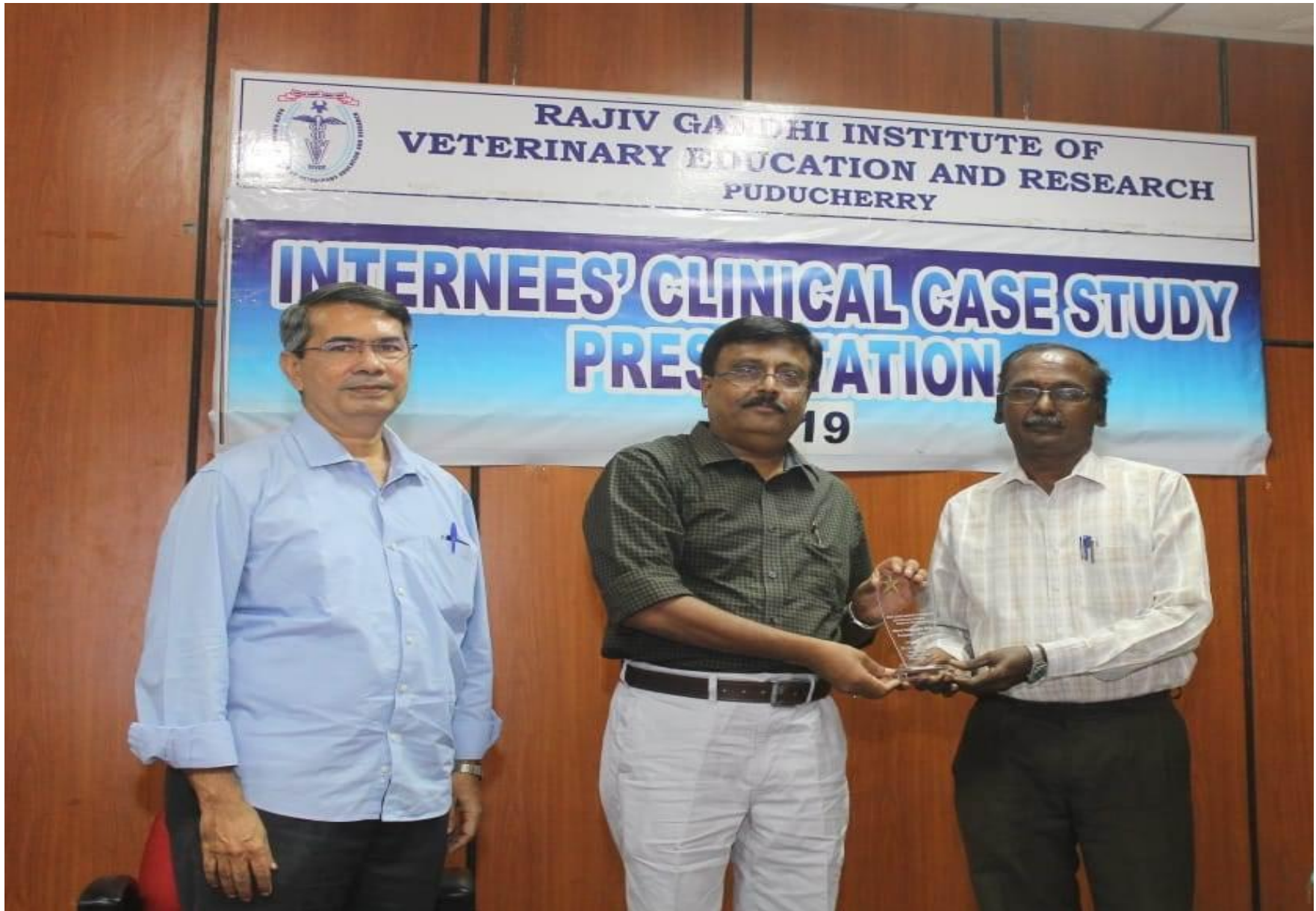
Clinical case presentation by internees and the best presentation awards. The Jury included the Joint Director from Animal Husbandry Department, Govt of Puducherry